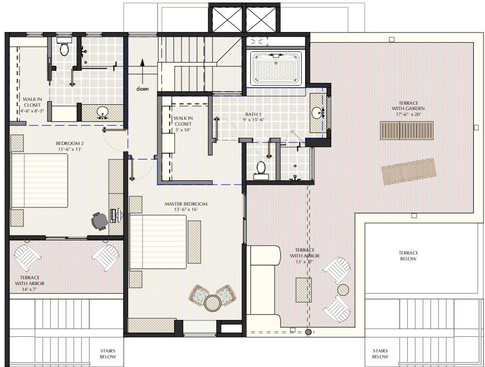
FLOOR PLAN LEVEL 3